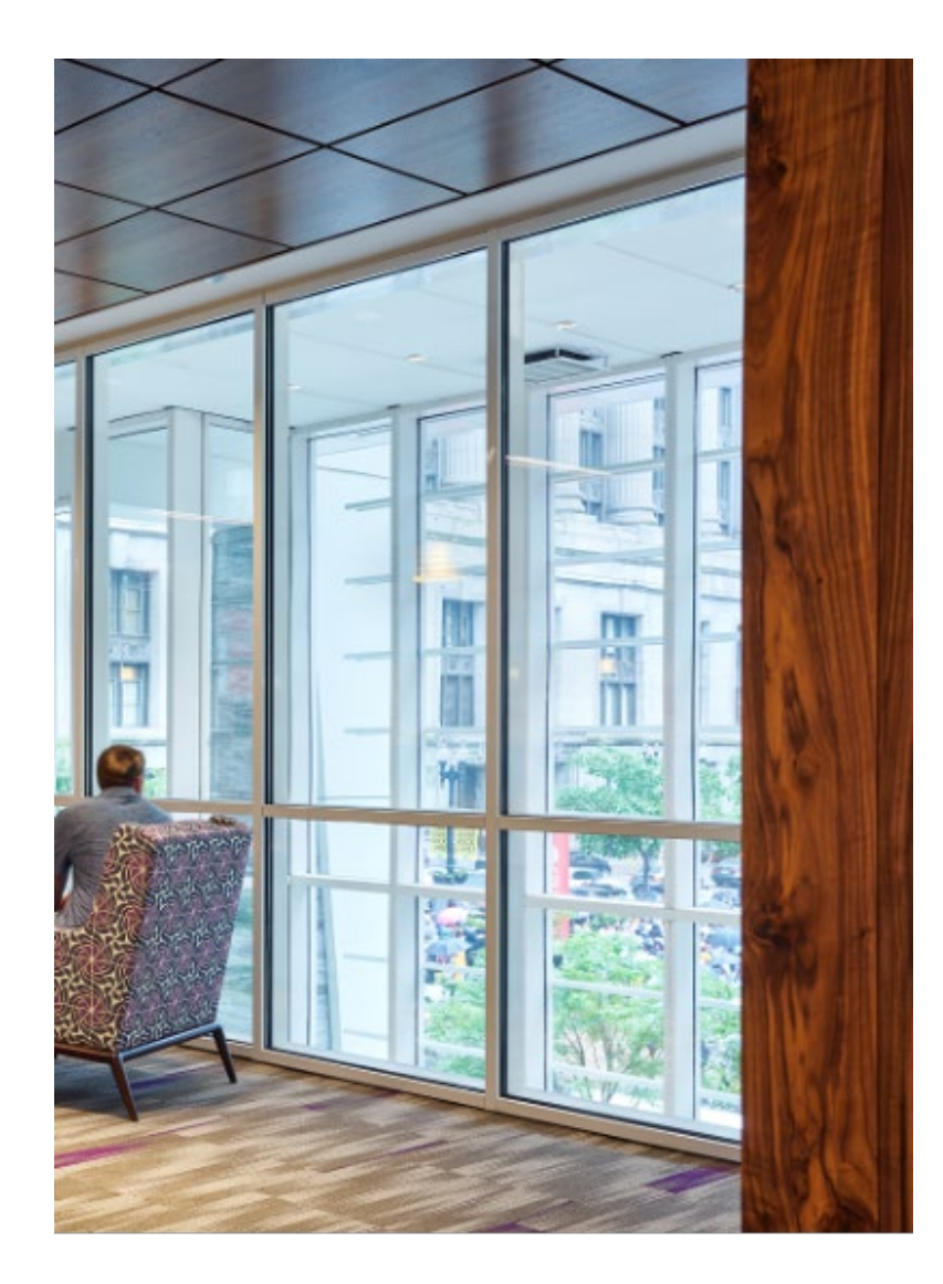
Fireframes<sup>®</sup> Curtainwall Series Fire-rated Frames

This EPD was created using a UL-verified EPD generator for Allegion's full product portfolio. For additional product specific EPDs, please contact Allegion at Tim.Weller@allegion.com.