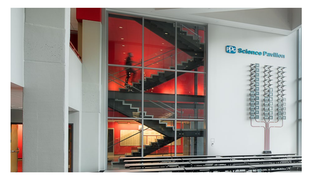
Figure 1: Fireframes® Curtainwall Series Frame

This EPD covers the Fireframes® Curtainwall Series frame system installed with Pilkington Pyrostop® monolithic glass (120-202, 60-500, or 90-102).